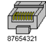
Bel Stewart RJ45 Part Number: 940-SP-3088R-031

Hirose HR25 Hosing P/N: HR25-9TP-12PC Contact P/N: HR25-PC-111