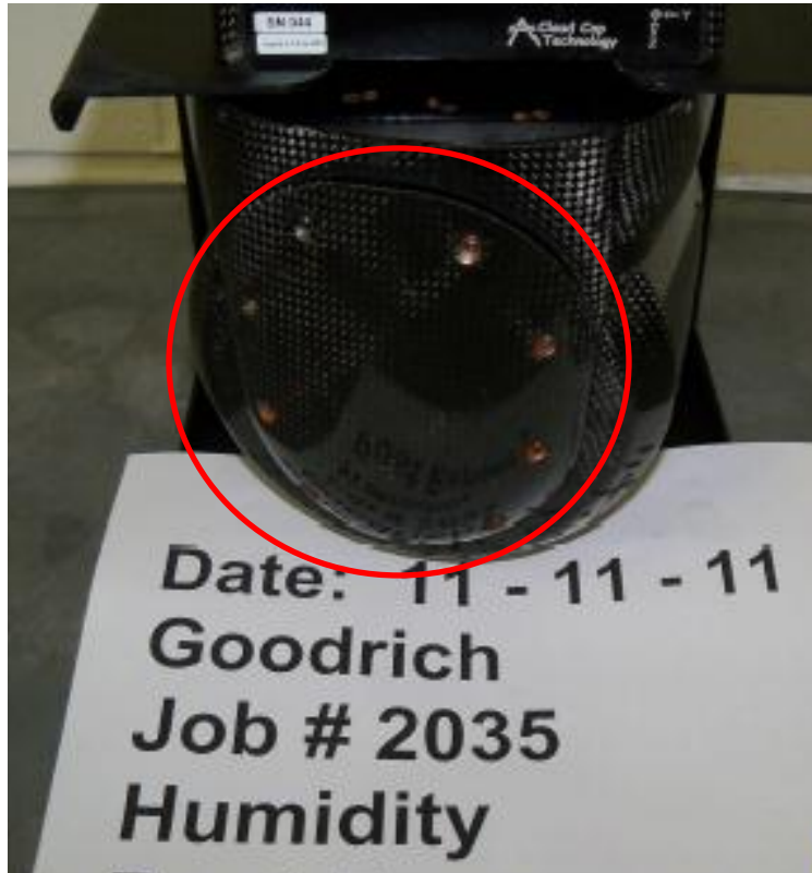
Figure 4 - Clevis Access Cover Screws

Minor iron oxidation on clevis access cover screws ( Figure 4 ).