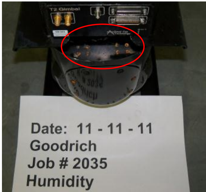
Figure 2 - Clevis Base Screws

Minor iron oxidation on clevis base screws (Figure 2).