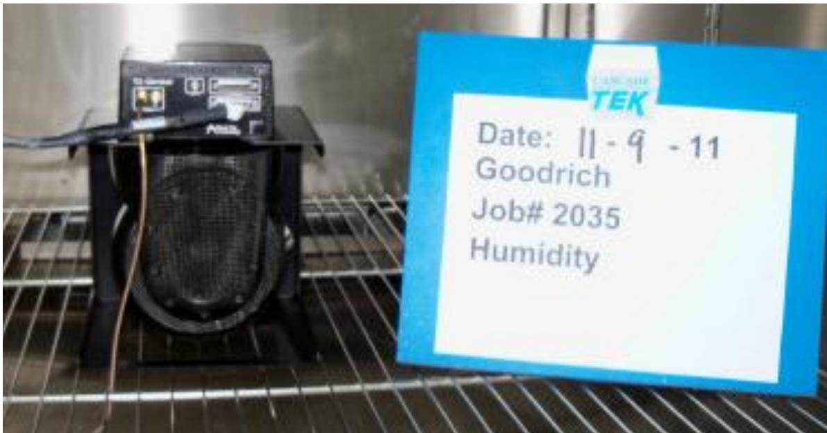
Figure 1 - TASE300 Humidity Test